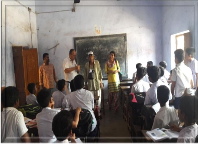
SPKF team explaining Teacher on Call process to the students of Sajina Public High School, Suri, Birbhum