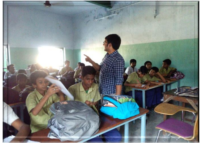
SPKF team visiting South Suburban School in Kolkata to enlighten the students on the Teacher on Call program