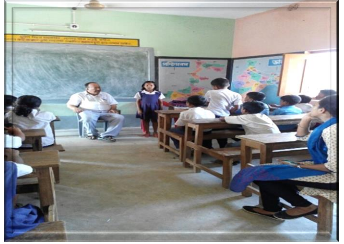
Students of Kuchuighata Junior High School, Sainthia, Birbhum showcasing their extra-curricular activities in front of The Chairman, SPKF