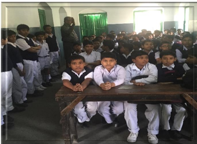
Photo of the students in the classroom of Mitra Institution, Bhawanipore, Kolkata along with the Head of the institution

In the pilot phase of the project the Chairman, SPKF visited Mitra Institution, Bhawanipore, Kolkata as the first school to initiate the program. Next, communication was made with some of the schools Kolkata and Birbhum and visited a few of those to reach out to a larger segment of students and wider circulation about the availability of this free service.