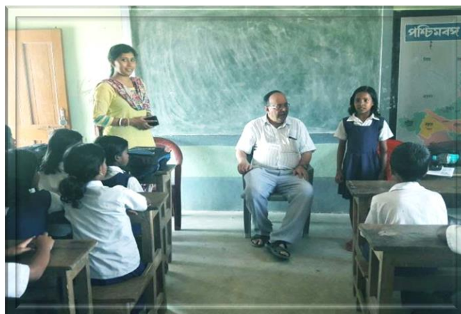
Photo of students of Kuchuighata Junior High School, Sainthia, Birbhum during school visit of SPKF team.

Students need to call at the service number, as per the input selection, for IVR to help them to talk to the respective teachers.