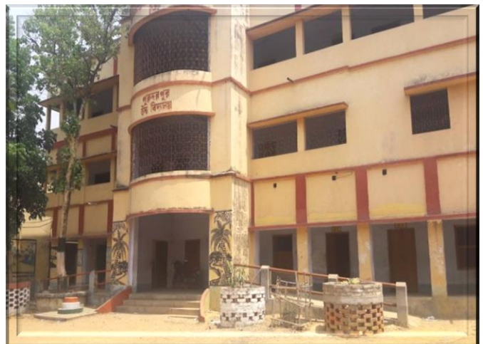
Photo of Purandarpur High School, Suri in Birbhum visited by SPKF team during pilot phase