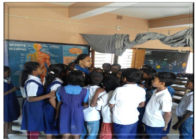
SPKF team addressing the queries of students of Kuchuighata Junior High School, Birbhum regarding Teacher on Call process