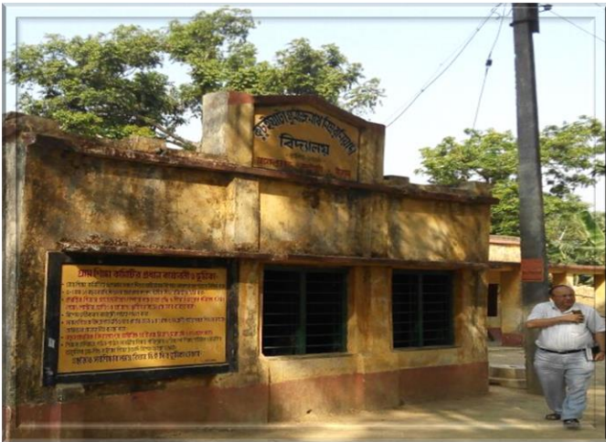
SPKF team visiting a school in Birbhum to encourage the students to learn from Sahaj Path