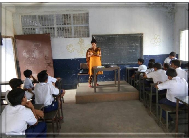
Students of Ramrick Institution, Kolkata, following the mechanism of Teacher on Call process demonstrated by SPKF team